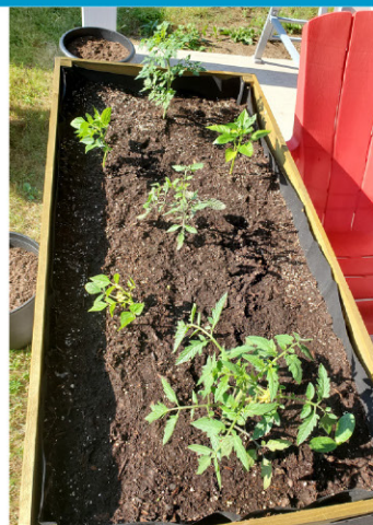
Later this season, tomatoes, peppers and fresh herbs will be available.